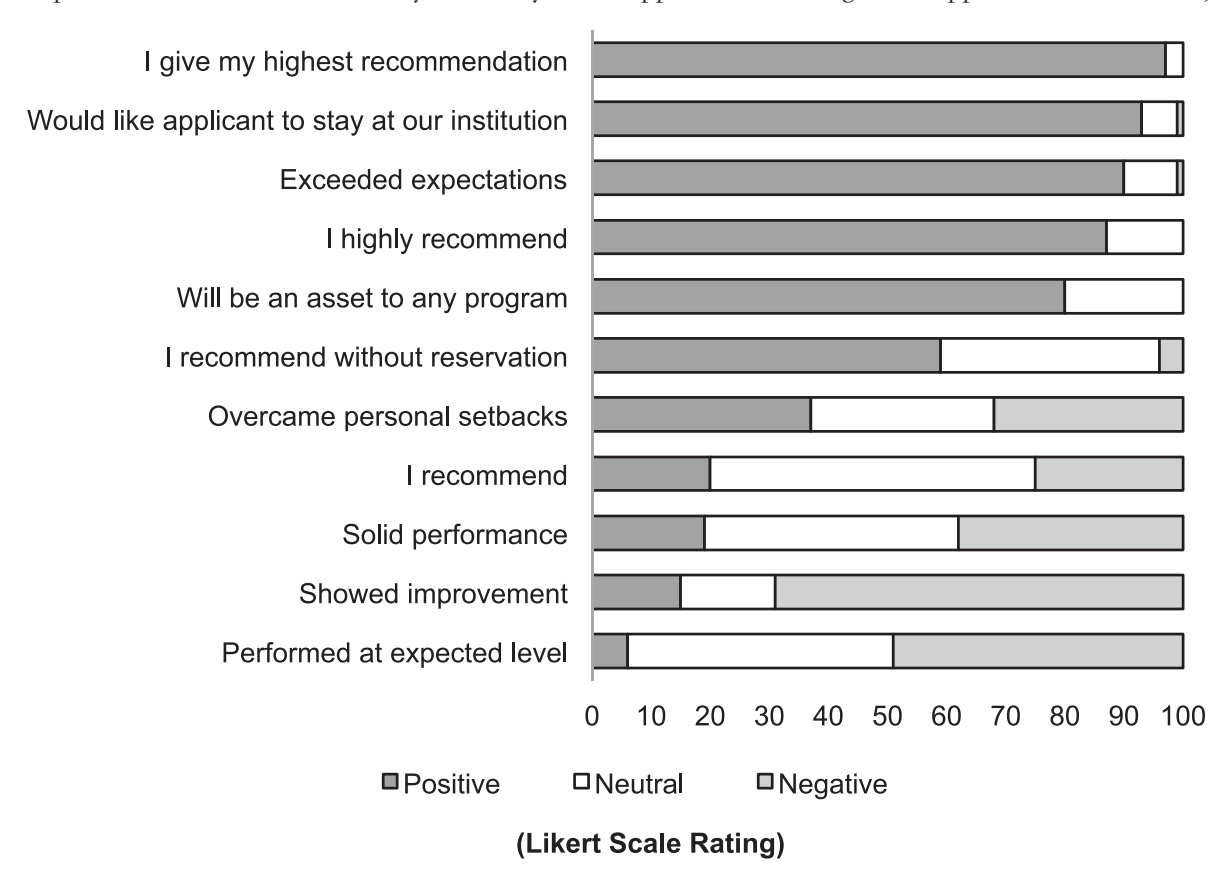
FIGURE 2 Percentage of Program Directors Rating Phrase Positive, Neutral, and Negative

PDs consider the LOR important, and the quality of the letter influences readers' decisions about the applicant. Although an applicant's class rank,