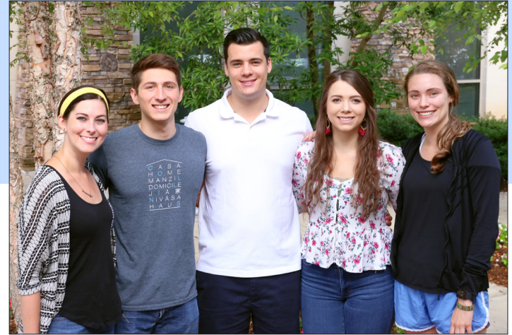
2019 Kenan Scholars

We provide enriching experiences in an intimate and ideal educational setting in which students actively participate in addressing the challenging issues facing rural populations.